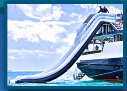
Fly down the 9 metre water slide!