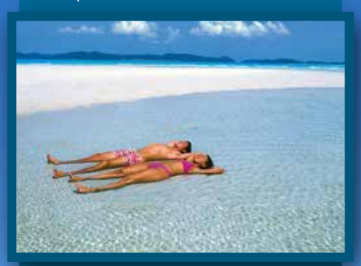
Relax and enjoy the sunshine.