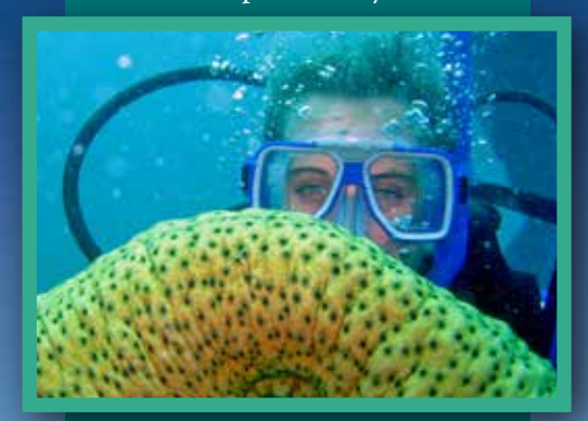
Enjoy the fun activities on board!