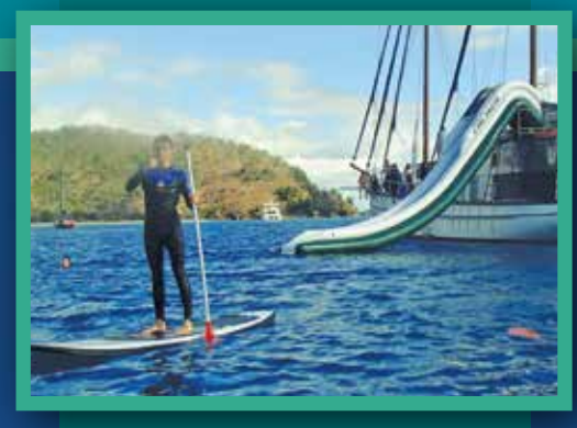
Paddle and explore the crystal waters.